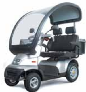
Dual seat with canopy

AfiScooters are advanced, electrically-powered mobility scooters and are designed with reliability and driver safety in mind. Meet European EN-12184 and US safety standards with FDA approval, hold ISO9001-2000 and Australian certification.