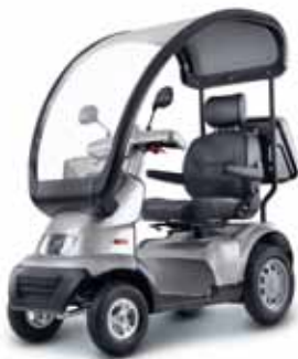
Single seat with canopy